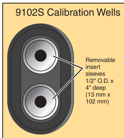
9102S block configuration. Instrument includes 1/4" and 3/16" inserts. Order additional sizes as needed.