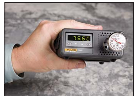
Take the 9100S anywhere. It's the smallest dry-well in the world.