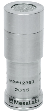
MPIII Pressure Data Logger