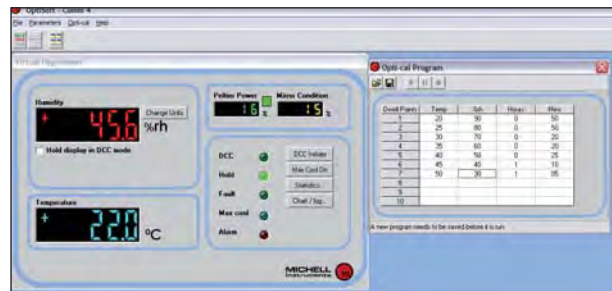
Logging and profiling software

Probe ports up to 5 – sensor body diameters 5–25mm (0.2 to 0.98”) accommodated by port adapters Chamber volume 2000 cm 3 (122.1in 3 ) Chamber dimensions 105 x 105 x 160mm (4.13 x 4.13 x 6.3”) (wxhxd) Instrument dimensions 520 x 290 x 420mm (20.5 x 11.4 x 16.5”) (wxhxd) Set point resolution 0.1 for humidity and temperature Displays High definition 2 lines alpha numeric Measurement units °C, °Cdp, % RH g/kg, g/m 3 , (t-t d ), a w Outputs Analog Two channels 4-20 mA or 0-20 mA Digital RS232 (RS485 optional) Alarm Volt free contact, 2A @ 30 V DC Supply 85–264 V AC, 47–63 Hz, 150 VA Weight 20kg (44lb)