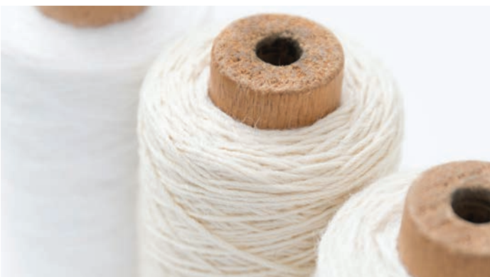
Textiles & Wood