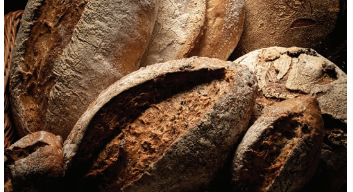
Food & Produce