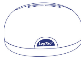
LTI HID Not Included