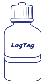
Buffer assembly Not Included (Silica sand recommended for temperatures below -40^{\circ}\text{C} )