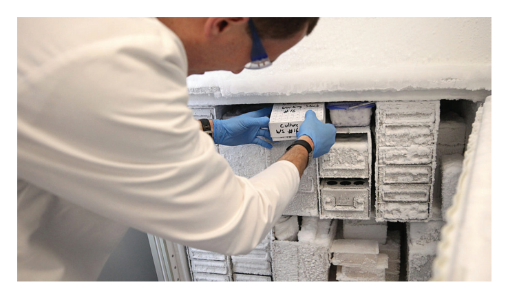
Vaccine & Pharmaceuticals