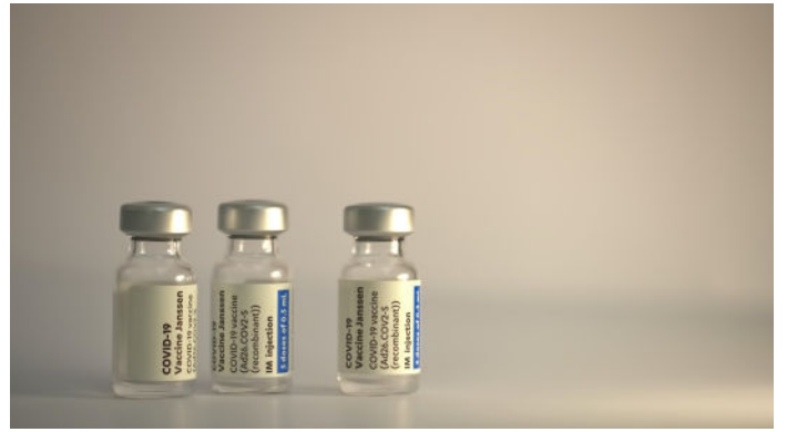
Pharmaceutical & Vaccine